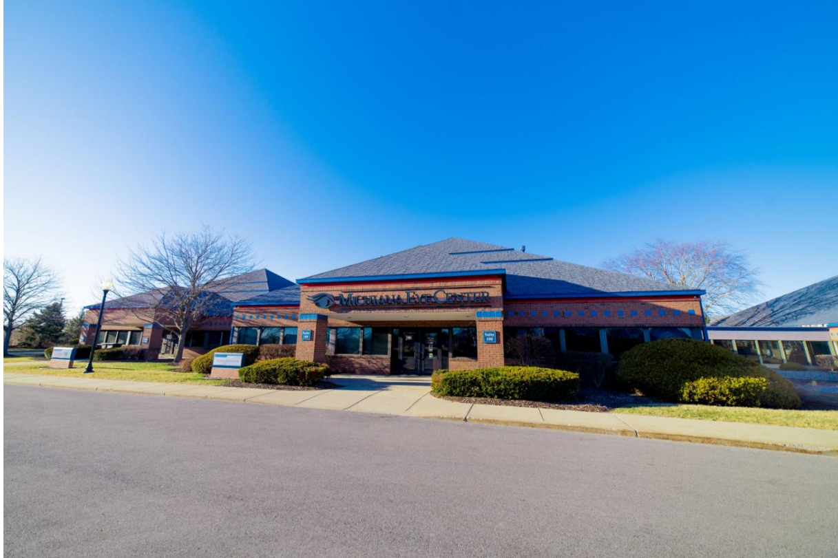
Michiana Eye Center, located in Mishawaka, Indiana.

Mishawaka/April 1 st , 2019 —Michiana Eye Center, a five-location ophthalmology and optometry practice, is expanding their flagship location in Mishawaka to feature an additional office space for state-of-the-art surgical consultations.