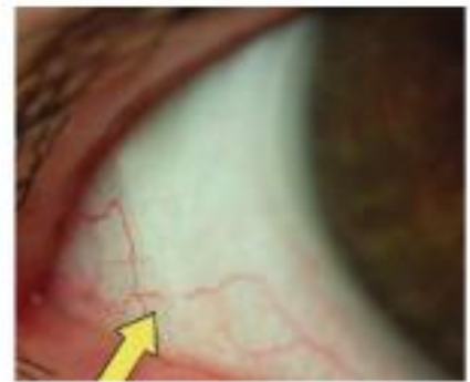
Before and After conjunctivochalasis surgery with the use Amniograft® amniotic membrane tissue.

Michiana Eye Center, LLC is a five-location eye care practice located in Mishawaka, South Bend, Plymouth, Elkhart, and Goshen. Committed to serving the Michiana community since 1980, three ophthalmologists, eight optometrists, and over 70 employees comprise a family of experienced professionals with a mission to preserve and restore vision, and prevent blindness, where uncompromising care meets trusted technology to ensure a lifetime of ocular health. For more information, visit www.MichianaEye.com .